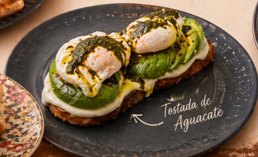
Tostada de Aguacate